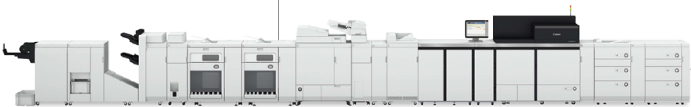
imagePRESS V1350 shown with optional accessories.

This robust feeder is equipped with Tornado suction feeding and air-separation. It contains a single cart that supports up to 13" x 30" and 150 lb. Cover. The 5,000-sheet capacity* allows jobs to run with minimal interruption.