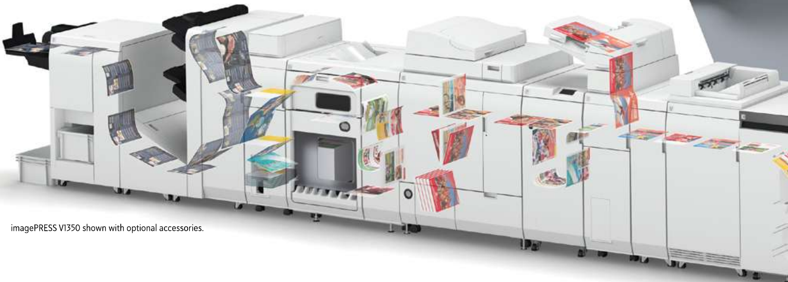
imagePRESS VI350 shown with optional accessories.