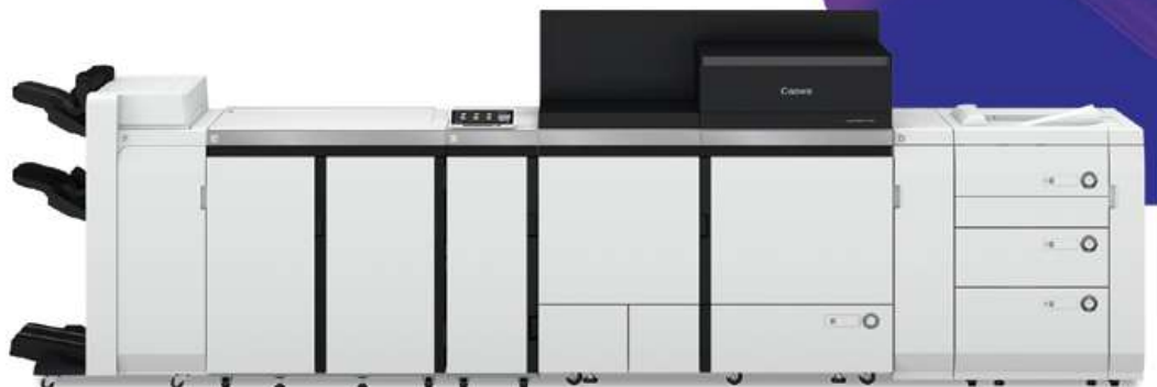
imagePRESS V1350 shown with optional accessories.