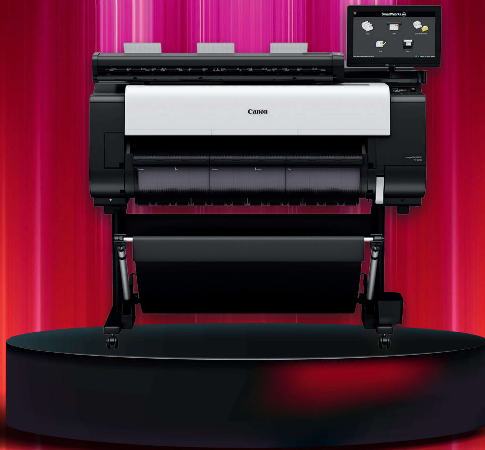
imagePROGRAF TX-3200 MFP Z36