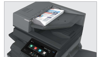
High capacity 300-sheet D SPF scans documents at up-to 280 images per minute.