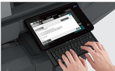
Built-in retractable keyboard simplifies email address and subject line entries.