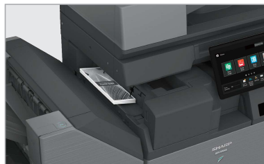
New Inner Folding Unit option offers a variety of fold patterns, including tri-fold, z-fold and others.