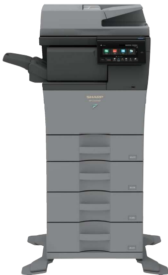
BPC545WD shown with Inner Finishing Unit in a 4-drawer configuration.